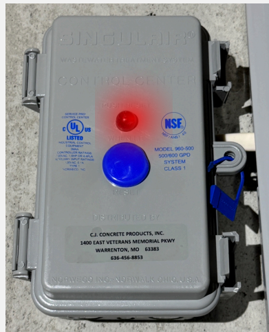
Basement Aerator Alarm