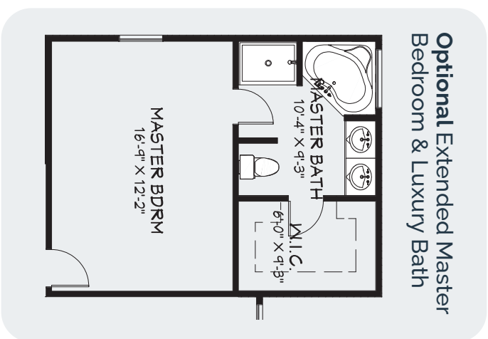
Optional Extended Master Bedroom & Luxury Bath